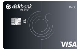
Visa Platinum Debit